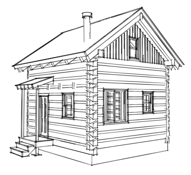
'Long Hunter' Sketch Perspective

- a Mountain Works Log Cabin Mini-Home Kit