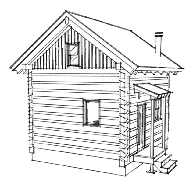
'Long Hunter' Sketch Perspective